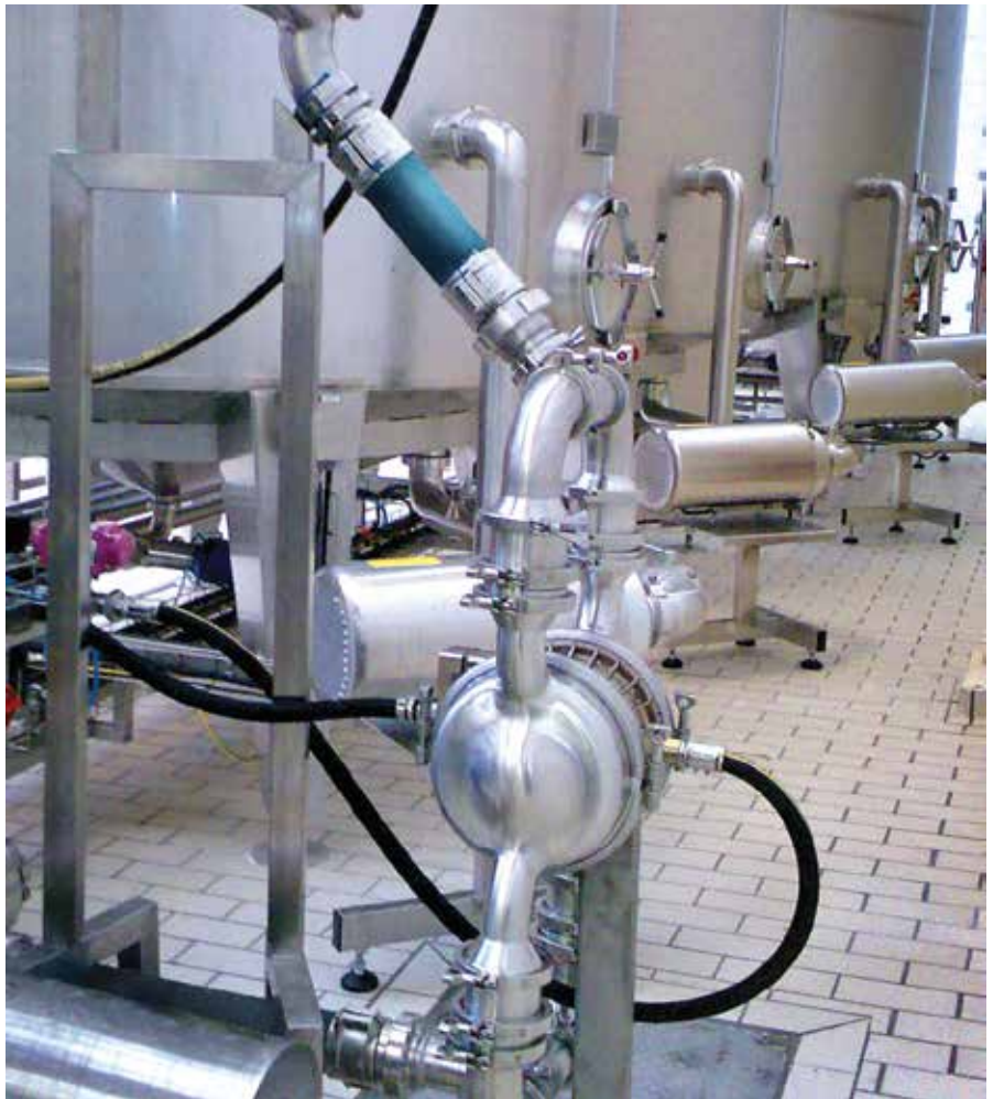
Image 1. Specific AODD pumps can offer a number of operational benefits that make them better-suited for soft-drink production than centrifugal pumps, including sealless design, dry-run capability, shear sensitivity and higher energy efficiency.

The U.S. landscape is dotted with soft drink production facilities, known as canning and bottling plants, that use ingredients such as high fructose corn syrup, various concentrates, flavorings and phosphoric acid (which adds acidity to the final beverage) to create products that are ready for consumption.