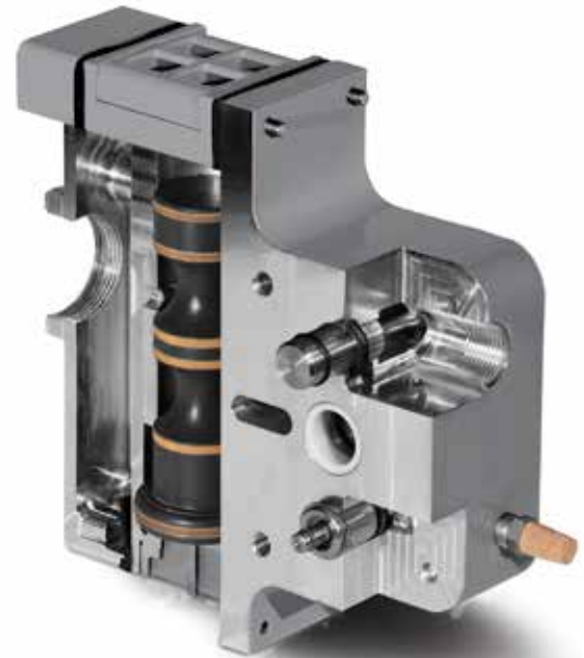
Image 3. This air distribution system (ADS) helps reduce AODD pump air consumption by up to 60 percent while providing higher flow rates per standard cubic foot per minute (SCFM) of air that is used.

shear-sensitive products, and they work well with corn syrups, phosphoric acids, concentrates and flavorings that play a major role in soft drink production. The wetted-path material is 316L stainless steel with interior-polish levels