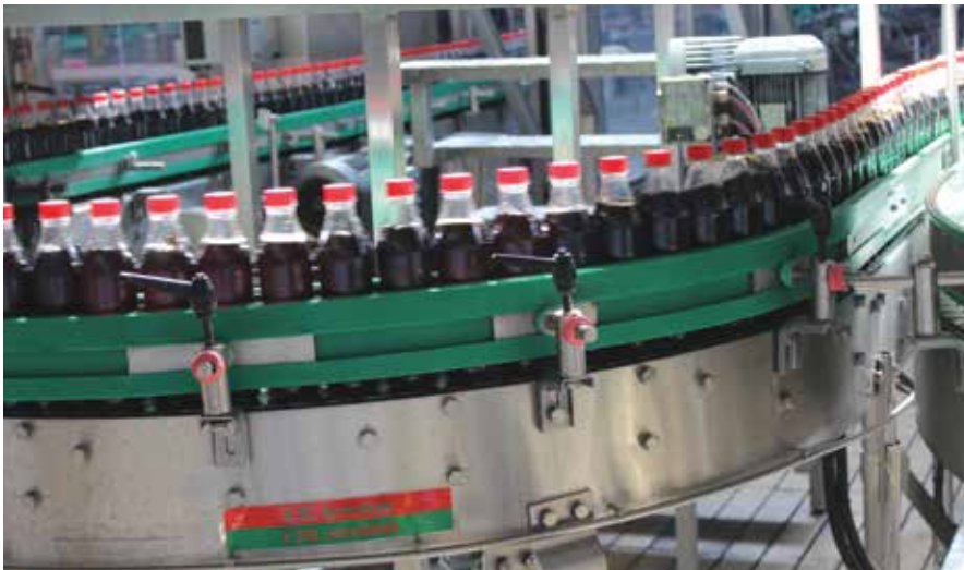
Image 2. From the time raw materials—including concentrates, corn syrup, flavorings, phosphoric acid and more—arrive at the soft drink manufacturing and bottling plant to the point where finished products are put in bottles and cans, a large number of liquid-transfer operations must be completed successfully.

Achieving the desired end product requires carbonated soft drinks to be manufactured using a strict regimen: