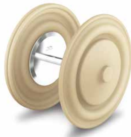
Image 4. One type of diaphragm has been designed with an integrated stainless-steel core that uses no adhesives or nylon fabric, which eliminates product-entrapment areas and greatly reduces contamination risks.

This technology achieves up to a 60 percent savings in air consumption over competitive AODD pumps, while